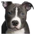
Pit Bull Terriers

Akita, American Bulldog, Bullmastiff, Mastiff, Chow, Doberman, German shepherd, Husky, Presa Canario, Pit Bull, Siberian Husky, Staffordshire Terrier, "Wolf Dog", Bull Terrier, Pit Bull Terrier, Rottweiler and any combination of these.